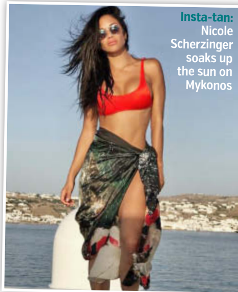
Insta-tan: Nicole Scherzinger soaks up the sun on Mykonos

Mykonos WHILE Mykonos still buzzes with gangs of finance gays in £125 swimming trunks, it's also ever more popular with the glitterati. Lindsay Lohan just threw her 31st birthday here, the Rooneys were spotted on Kalo Livadi beach last month and Nicole Scherzinger just popped over for a spot of Instagramming. This season's most talked-about opening is the Kenshō Boutique Hotel & Suites, where you'll find a buzzy restaurant, views out over Ornos beach and private plunge pools aplenty. From £3,500 per person for six nights from Aug 19–23, including private transfers and a culinary tour of the island