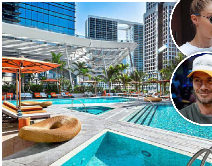
Star spot: Gigi Hadid and David Beckham have been seen in Miami of late

Miami Miami's mix of year-round sunshine and absurdly blingy hotels means it's always busy with the A-list. Go for a cocktail at the Fontainebleau Hotel in South Beach, which featured in The Bodyguard and Scarface, and you might rub shoulders with Gigi Hadid, David Beckham or Zoe Kravitz, all of whom have been spotted in town lately. Or for less bling, try Wynwood or the Design District for a spot of shopping. The new East hotel in Brickell is conveniently located for both and its rooftop bar, Sugar, regularly has queues around the block – although as a guest you can slip in discreetly. From £185 per night during Aug, east-miami.com