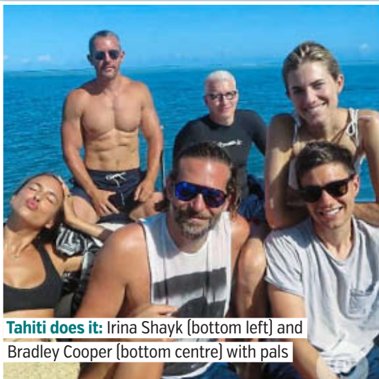
Tahiti does it: Irina Shayk (bottom left) and Bradley Cooper (bottom centre) with pals