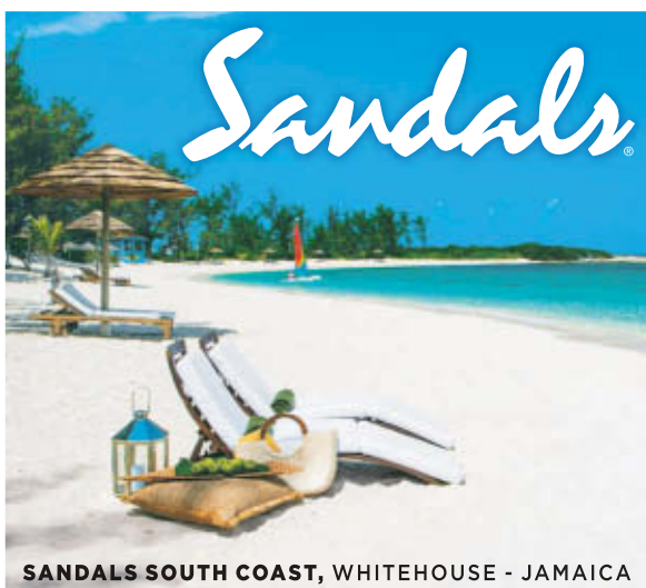
SANDALS SOUTH COAST, WHITEHOUSE - JAMAICA

Located on the Finest Beaches of the British Caribbean.