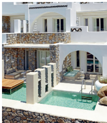
Clockwise from above One of the soothingly decorated Junior Suites; relax in your own hot tub; the Junior Suite pools